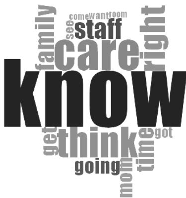
Most frequent words from Site 3 data